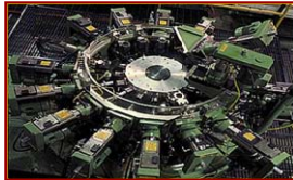
Rotary Transfer Capabilities